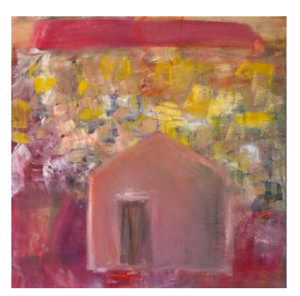
Pale Pink House at Sunset, 2024 oil on panel, 36" x 36".