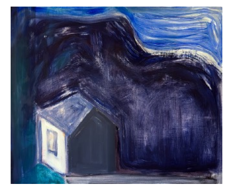
White House at Night, 2024 oil on panel, 20" x 24"

Her creative process is intuitive and meditative. She approaches each painting from a place of unconscious authenticity, allowing forms and colors to surface naturally, emanating from "a deep place" within her unconscious. These paintings transcend straightforward representation, instead becoming portals to a pre-verbal, emotional depth that reveals itself gradually. They are symbolic portraits and self-portraits, repositories of ancestral spirits, and vessels of familial love.