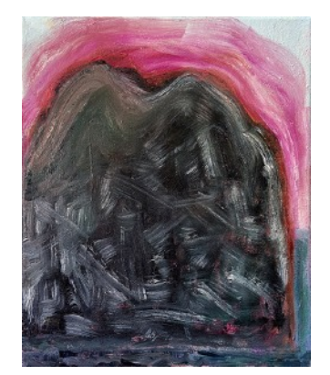
Magic Mountain, 2025 oil on canvas, 18" x 22"