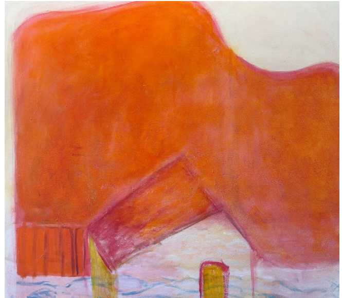
White House by the Sea, 2024 oil on canvas, 54" x 58" $7,000.00