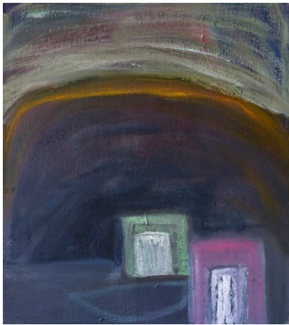
Two Houses at Dusk, 2024 oil on linen, 18" x 16" $1,300.00