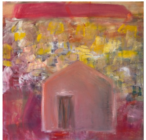
Pale Pink House at Sunset, 2024 oil on panel, 36" x 36". $3,200.00