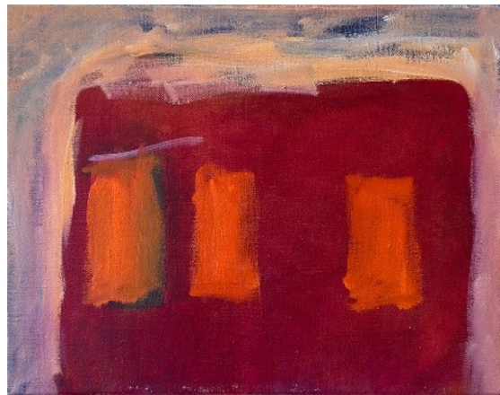
Lights On, 2025 oil on linen, 11" x 14" $800.00