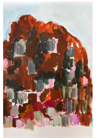
Island Houses, 2025 gouache on paper, 12" x 9" $400.00