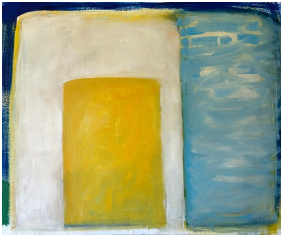
White House with Yellow Door, 2025 oil on linen on panel, 30" x 36" $2,800.00