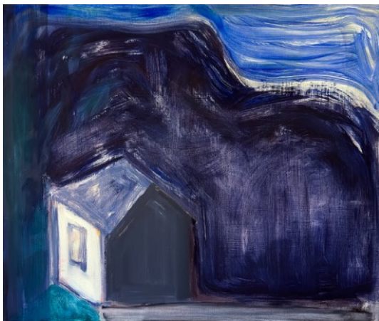
White House at Night, 2024 oil on panel, 20" x 24" $1,800.00