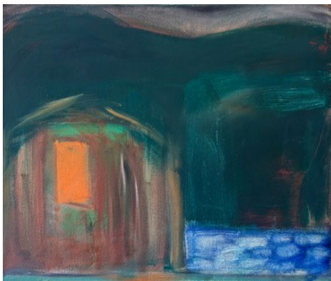
Lake House at Night, 2024 oil on canvas, 18" x 20.5" $1,500.00