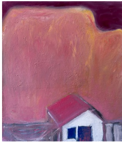
Violet Sky, 2025 oil on linen, 32" x 28". $2,400.00