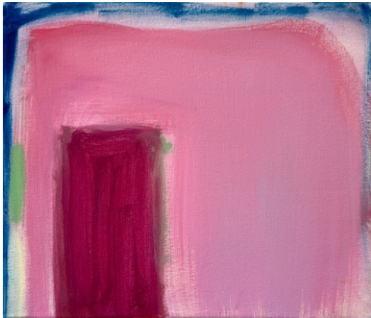
Pink House with Dark Pink Door, 2025 oil on canvas, 12" x 14" $900.00