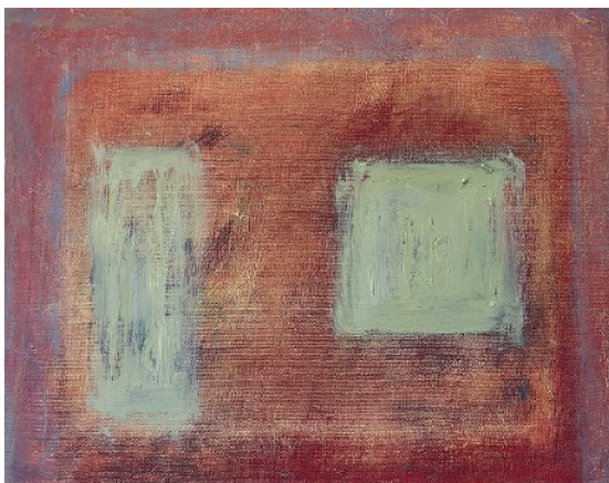
Pale Green Shutters, 2025 oil on linen on panel, 9" x 12" $700.00