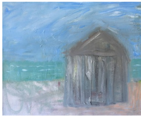
Fisherman's Hut by the Sea, 2024 oil on linen, 17" x 21". $1,500.00