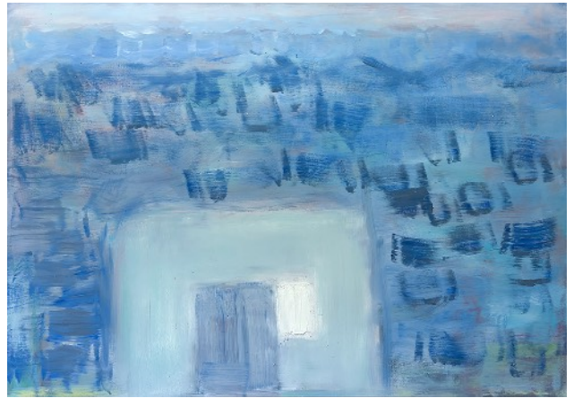
Green House with White Shutters, 2024 oil on panel, 34" x 48" $4,000.00