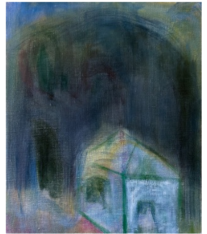
White House with Nighttime Mountains, 2024 oil on linen on panel, 24" x 20" $1,800.00