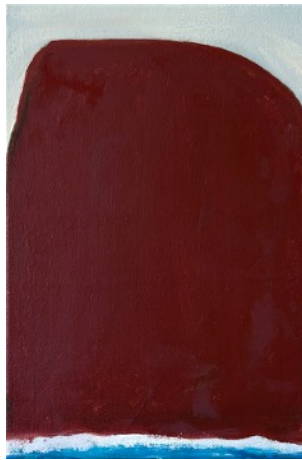
The Mountains and the Sea, 2025 oil on canvas, 18" x 12" $1,000.00