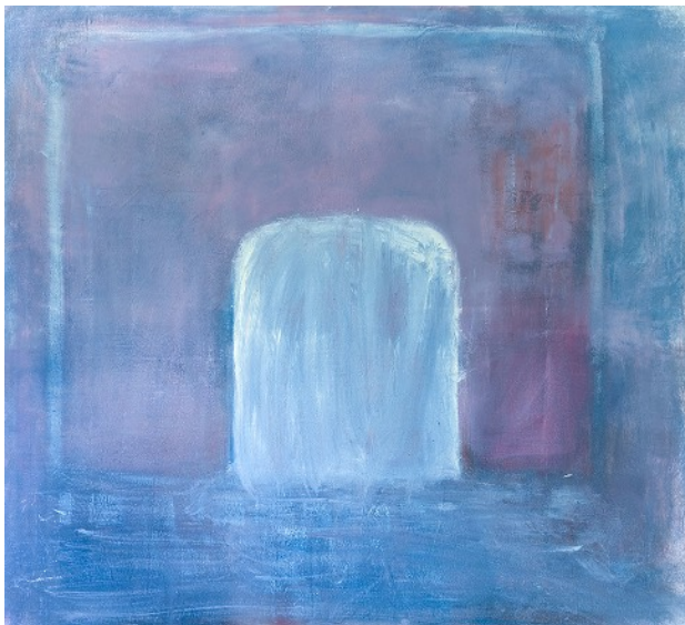
Beach House in the Rain, 2024 oil on canvas, 54" x 60" $7,000.00