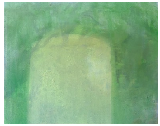
Entrance, 2025 oil on canvas, 16" x 20" $1,400.00