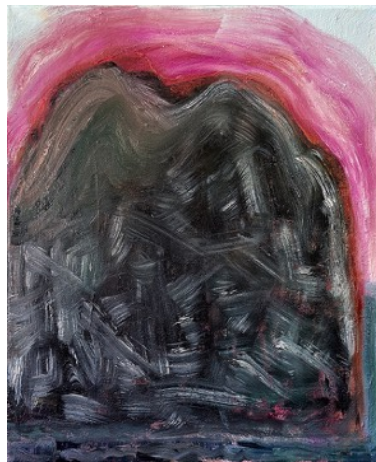
Magic Mountain, 2025 oil on canvas, 18" x 22" $1,500.00