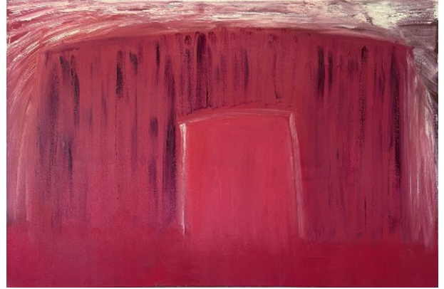
Pink House at Low Tide, 2025 oil on canvas, 36" x 54" $5,000.00