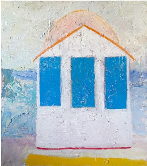
Beach House with Blue Shutters, 2024 oil on canvas, 60" x 54" $7,000.00