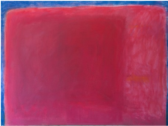
Untitled, 2025 linen on canvas, 35" x 47" $3,900.00