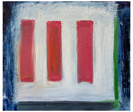
Colonial House at Dusk, 2025, oil on canvas, 18" x 21" $1,500.00