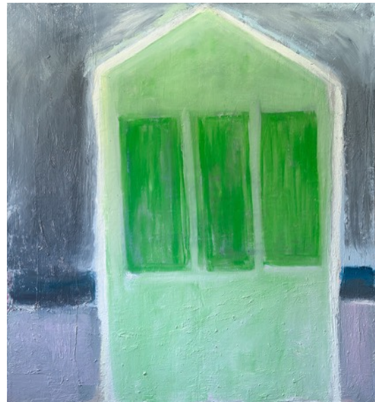
The Glacier Knocks in the Cupboard, 2025 oil on canvas, 60" x 54" $7,000.00