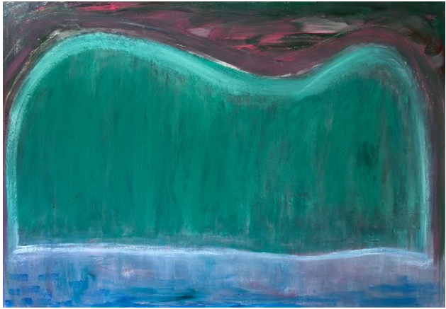
Bonete, Ihabela, 2025 oil on panel, 36" x 54" $5,000.00